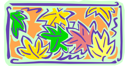
Fall is here: let's get homes ready for winter.

If you are being called to this ministry, remember: when God called Moses from the burning bush he answered, "Here I am, Lord."